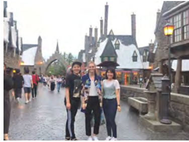
Universal Studio Japan