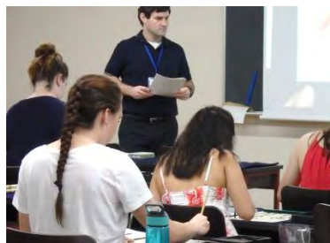
Cross-Cultural Communication Class

Some classes may not be available for your program. Photos are past programs.