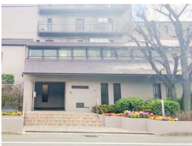
In front of the dormitory building